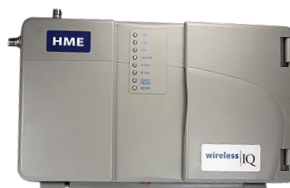
HME 6000 BASE STATION

Following are the programming instructions for your HME ION headset and HME 6000 base station.