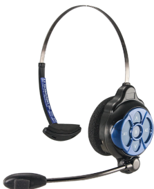
HME ION 6100 ALL-IN-ONE HEADSET