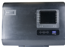
HME ION BASE STATION

Following are the programming instructions for your HME ION headset and HME ION base station.